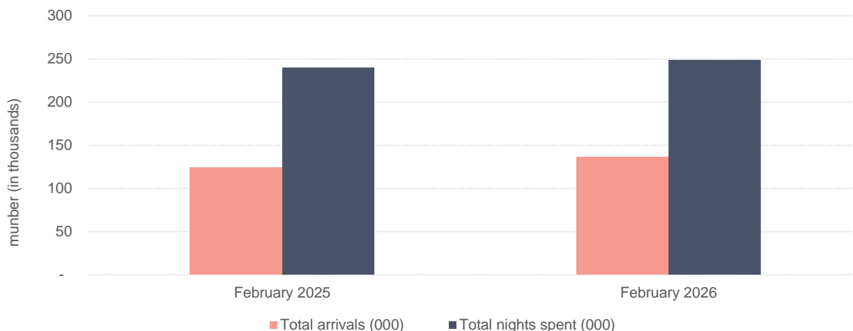
FIG.1 TOTAL ARRIVALS AND NIGHTS SPENT (000)

The room occupancy rate in hotels reached 16.7 %, compared with 16.0 % in February 2025.