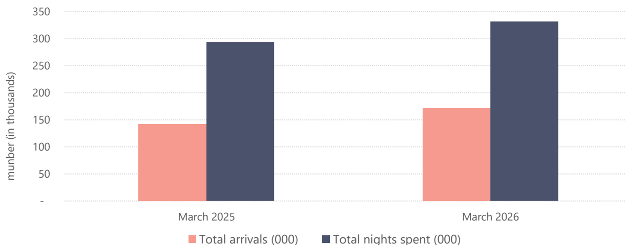
FIG.1 TOTAL ARRIVALS AND NIGHTS SPENT (000)

The room occupancy rate in hotels reached 18.5 %, compared with 18.1 % in March 2025.