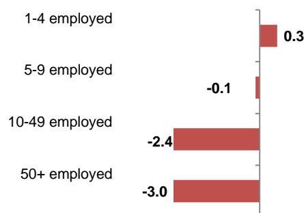
Fig. 3 Contributions of enterprises by size class, in turnover growth rate, 2020/2019

In producers of goods , the number of enterprises has decreased by 5.3 % compared to 2019, the number of employees has decreased by 3.9 % and turnover has decreased by 6.1 %.