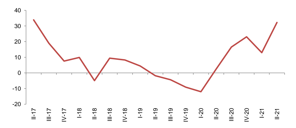
Fig. 4 Annual changes in Turnover volume index, Construction (%)