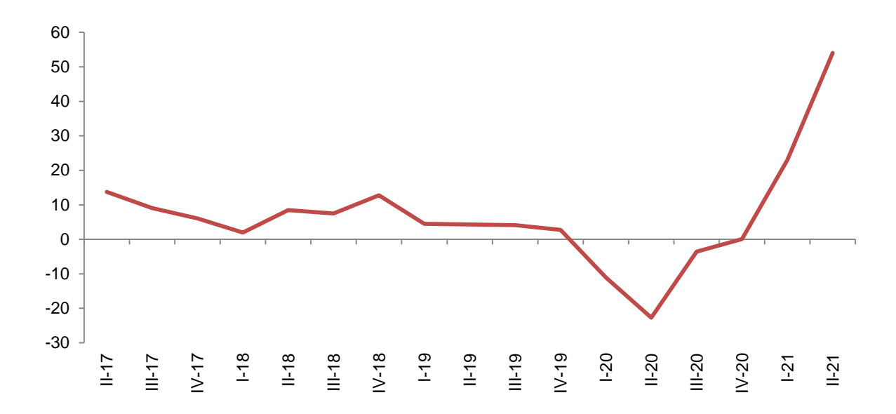
Fig. 1 Annual changes of Turnover volume index, Industry (%)