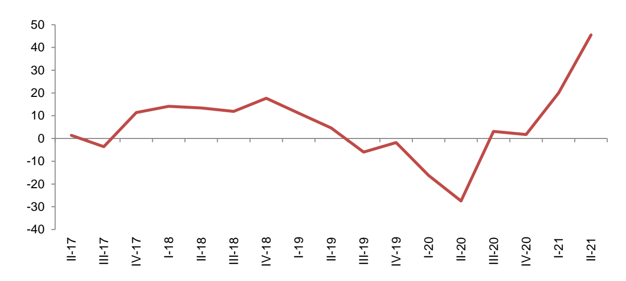
Fig. 3 Annual changes in Turnover volume index, Water supply; Sewerage, Waste management and Remediation activities (%)