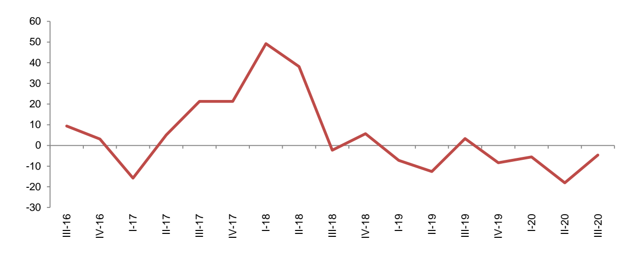
Fig. 2 Annual changes of Turnover volume index, Electricity, Gas, Steam