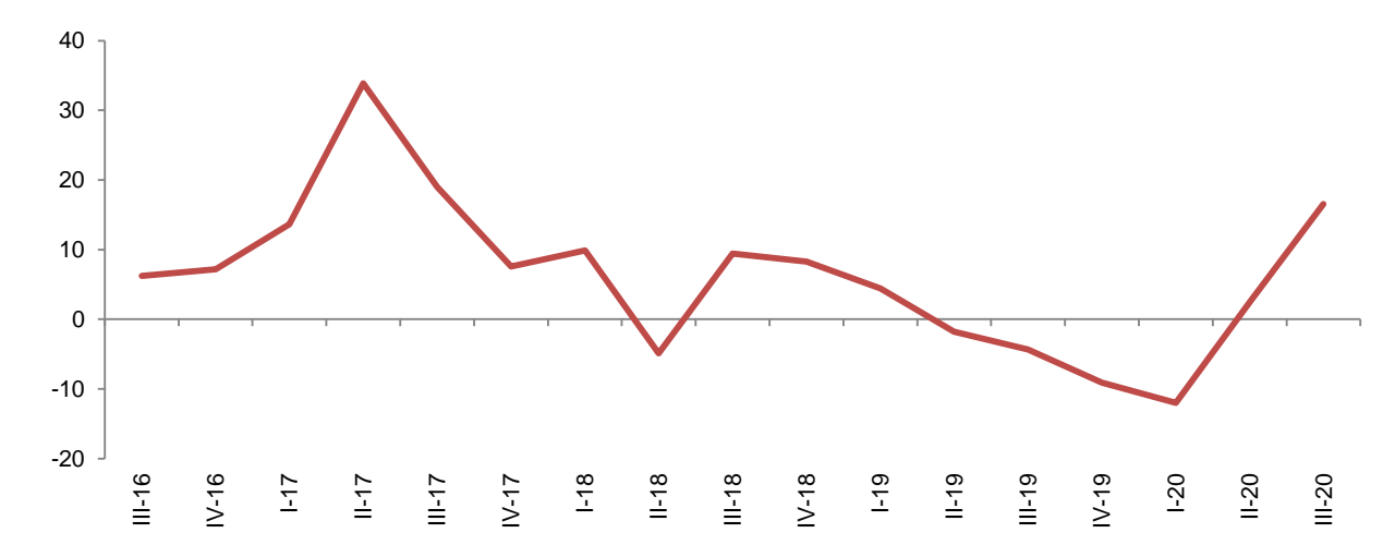
Fig. 4 Annual changes in Turnover volume index, Construction (%)