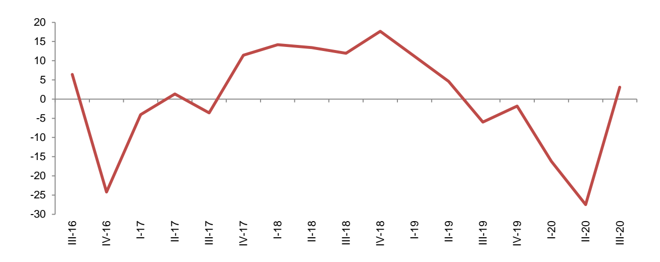
Fig. 3 Annual changes in Turnover volume index, Water supply; Sewerage, Waste management and Remediation activities (%)