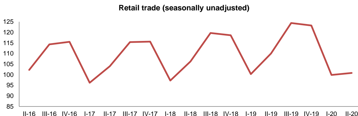
Fig. 1 Volume turnover index on retail trade

Tirana, September 15: In the second quarter 2020, the turnover volume index is 100.8. Sales volume on retail trade decreased 8.3 %, compared to the same quarter 2019. This indicator seasonally adjusted, compared with the previous quarter decreased 6.0%.