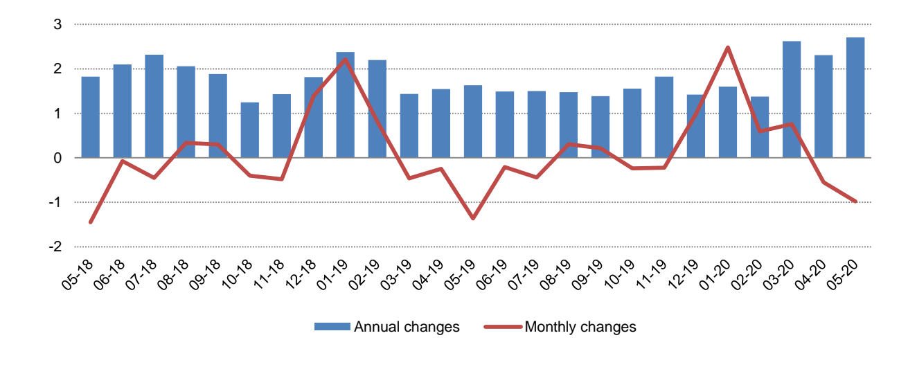
Fig. 1 Annual and monthly rates of HICP

In May 2020, the monthly rate measured by Harmonized Index of Consumer Price is -1.0 %. This is influenced mostly by decrease of prices in "Food and non-alcoholic beverages" by 2.3 %, followed by "Transport" by 0.7 %, "Clothing and footwear" by 0.5 %, "Recreation and culture" by 0.4 %, "Furniture household goods and maintenance" by 0.3 %, "Housing, water, electricity, gas and other fuels" by 0.1 %. Meanwhile, prices of "Communication" increased by 0.1 %.