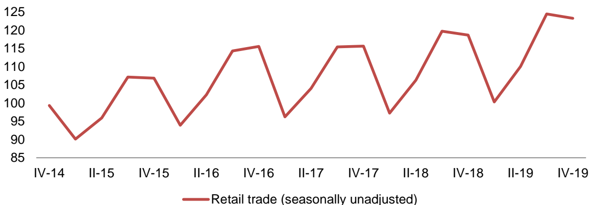
Fig. 1 Volume turnover index on retail trade

Tirana, March 12: In the fourth quarter 2019, the turnover volume index is 123.2 increasing 3.9 %, compared to the same quarter 2018. This indicator seasonally adjusted, compared with the previous quarter decreased 0.1 %.