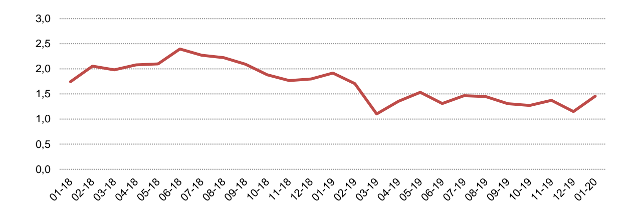
Fig. 1 Annual rate of consumer price index

Contribution of main groups in yearly changes of CPI: Annual growth rate in January was influenced mostly from prices of group "Food and non-alcoholic beverage" by +0.92 p.p., followed by "Housing, water, electricity and other fuel" by +0.31 p.p.. Prices of "Transport" group contributed by +0.10 p.p.. Prices of "Furniture household goods and maintenance" and "Recreation and culture" groups contributed by +0.07 p.p. each of them. Prices of "Hotels, coffee-house and restaurants" group contributed by +0.04 p.p.. Prices of "Alcoholic beverages and tobacco" group contributed by +0.02 p.p.. Prices of "Education service" and "Miscellaneous goods and services" groups contributed by +0.01 p.p. each of them. Prices of "Clothing and footwear" and "Health" groups contributed by -0.02 p.p. each of them. Prices of "Communication" group contributed by -0.01 p.p..