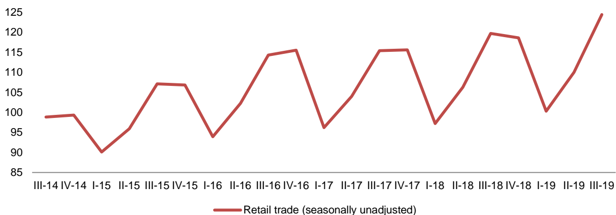
Fig. 1 Volume turnover index on retail trade

Tirana, December 12: In the third quarter 2019, the turnover volume index is 124.4 increasing 3.9 %, compared to the same quarter 2018. This indicator seasonally adjusted, compared with the previous quarter increased 2.0%.