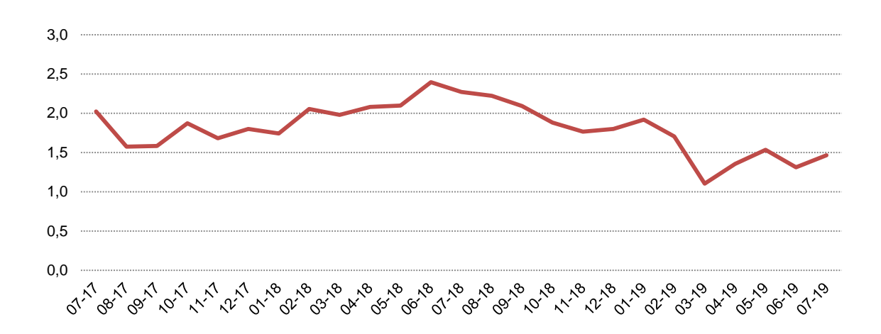
Fig. 1 Annual rate of consumer price index

Contribution of main groups in yearly changes of CPI: Annual growth rate in July was influenced mostly from prices of group "Food and non-alcoholic beverage" by +1.07 p.p. followed by "Housing, water, electricity and other fuel" by +0.16 p.p.. Prices of "Furniture household goods and maintenance" group contributed by +0.08 p.p. Prices of "Alcoholic beverages and tobacco" and "Hotels, coffee-house and restaurants" groups contributed by +0.04 p.p. each of them. Prices of "Recreation and culture" groups contributed by +0.03 p.p. Prices of "Education service" group contributed by +0.02 p.p.. Prices of "Clothing and footwear" group contributed by +0.01 p.p.. Prices of "Health" and "Transport" groups contributed respectively by -0.004 p.p. and 0.003 p.p..