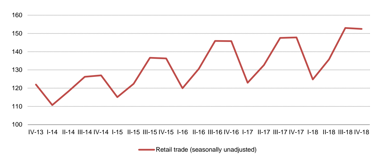
Fig. 1 Volume turnover index on retail trade

Tirana, March 13: In the fourth quarter 2018, the turnover volume index is 152.5 increasing 3.2 %, compared to the same quarter 2017. This indicator seasonally adjusted, compared with the previous quarter decreased 0.1%.