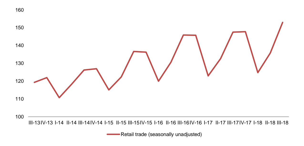
Fig. 1 Volume turnover index on retail trade

Tirana, December 13: In the third quarter 2018, the turnover volume index is 153.0 increasing 3.7 %, compared to the same quarter 2017. This indicator seasonally adjusted, compared with the previous quarter increased 3.3%.