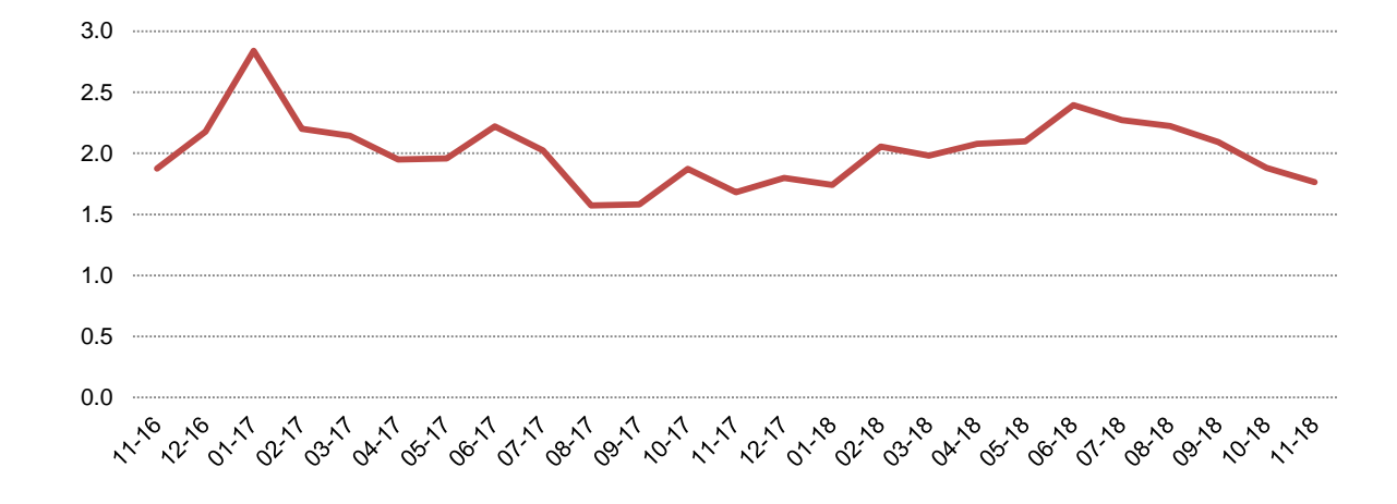
Fig. 1 Annual rate of consumer price index

The annual rate of consumer price index in November 2018 is 1.8 %, the same annual rate as one year before. Compared with October 2018, the monthly change of consumer price index in November 2018 is -0.2 %.