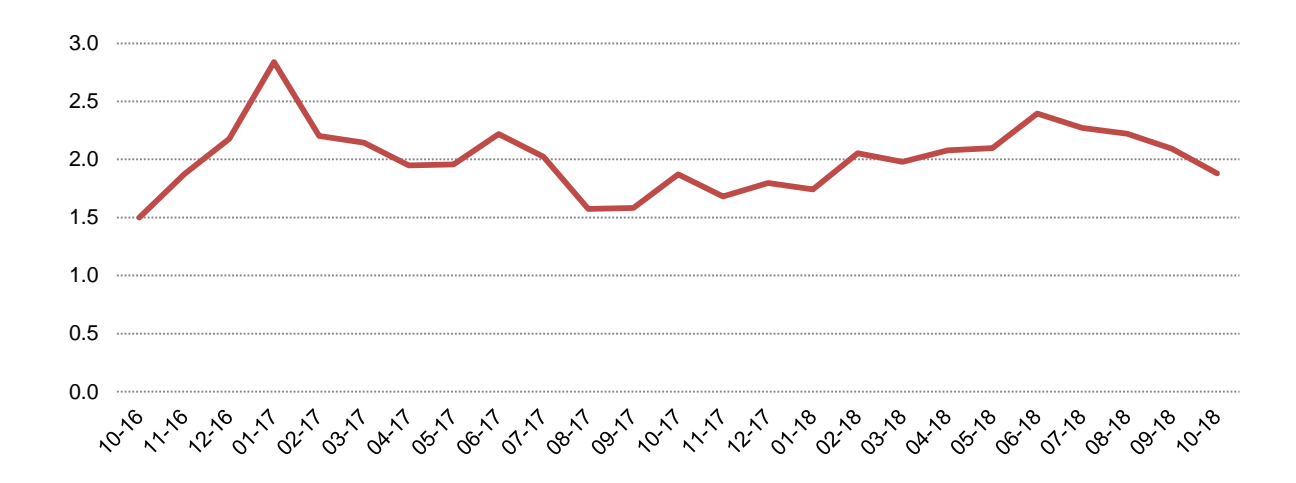
Fig. 1 Annual rate of consumer price index

The annual rate of consumer price index in October 2018 is 1.9 %, the same annual rate as one year before. Compared with September 2018, the monthly change of consumer price index in October 2018 is -0.2 %.