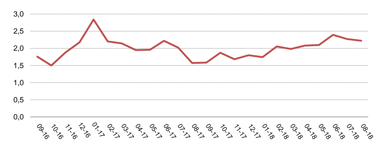
Fig. 1 Annual rate of consumer price index

Contribution of main groups in yearly changes of CPI: Annual growth rate in August was push up mainly from prices of group "Food and non-alcoholic beverage" by +1.10 p.p.. Prices of "Housing, water, electricity and other fuel" group contributed by +0.59 p.p.. Prices of "Transport" groups contributed by +0.18 p.p.. Prices of "Recreation and culture" groups contributed by +0.14 p.p.. Prices of "Clothing and footwear" groups contributed by +0.09 p.p.. Prices of "Alcoholic beverages and tobacco" group contributed by +0.06 p.p.. Prices of "Hotels, coffee-house and restaurants" group contributed by +0.04 p.p.. Prices of "Communication" and "Education service" groups contributed by +0.02 p.p. each of them. Prices of "Goods and different services" group contributed by +0.01 p.p. Prices of "Health" and "Furniture household goods and maintenance" groups contributed by -0.01 p.p. each of them.