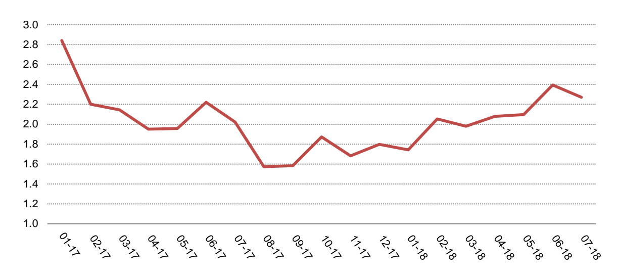
Fig. 1 Annual rate of consumer price index

Compared with June 2018, the monthly change of Consumer Price Index in July 2018 is - 0.3 %.