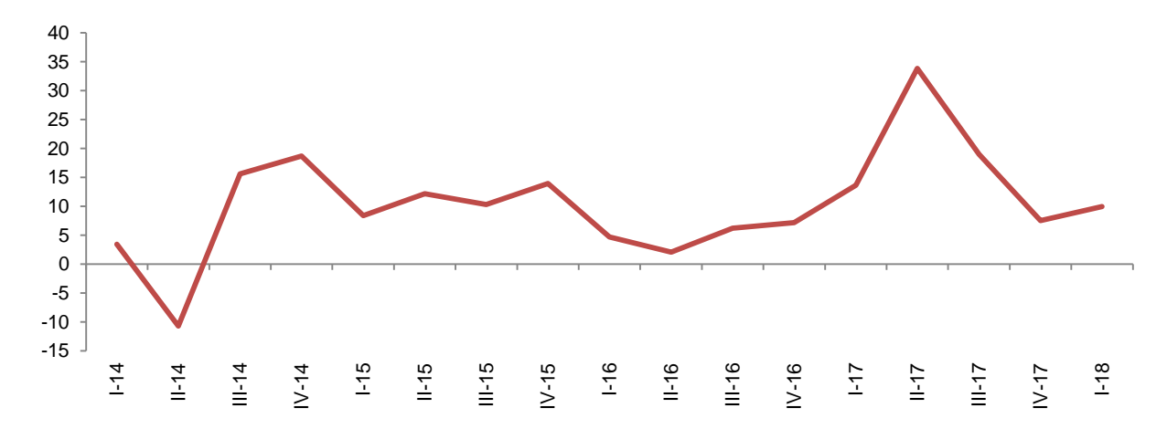
Fig. 4 Annual changes in Turnover volume index, Construction (%)