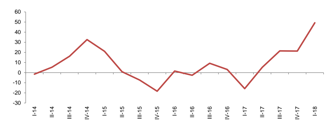
Fig. 2 Annual changes of Turnover volume index, Electricity, Gas, Steam