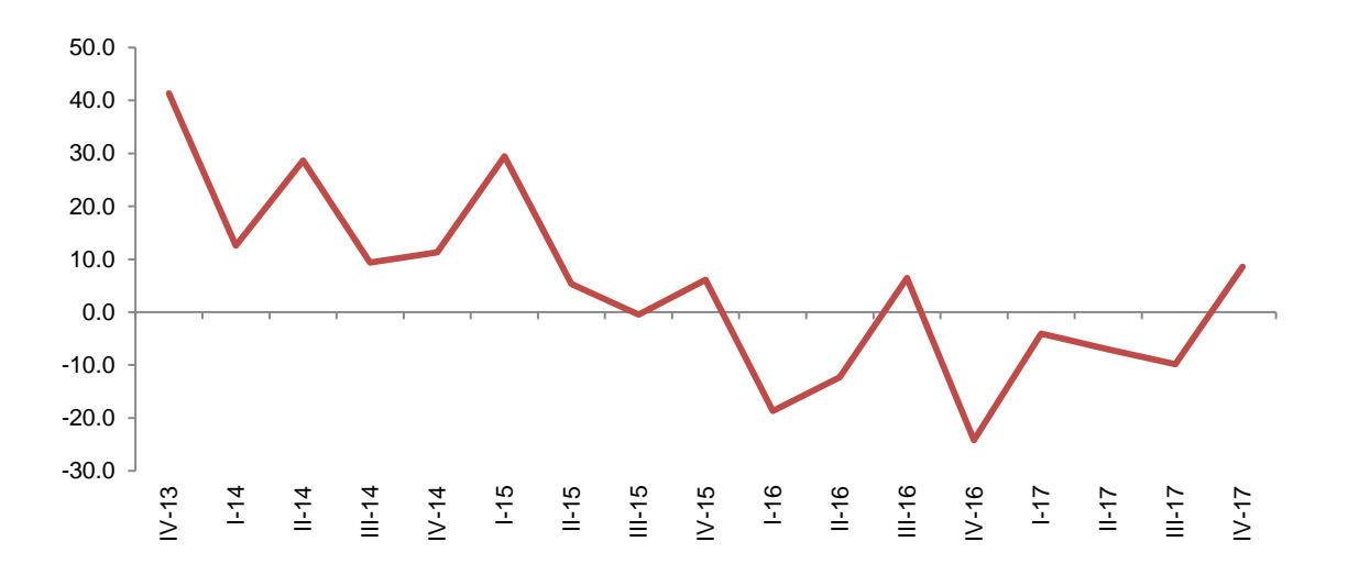
Fig. 3 Annual changes in Turnover volume index, Water supply; Sewerage, Waste management and Remediation activities (%)

For more information please visit our website: http://www.instat.gov.al/en/themes.aspx