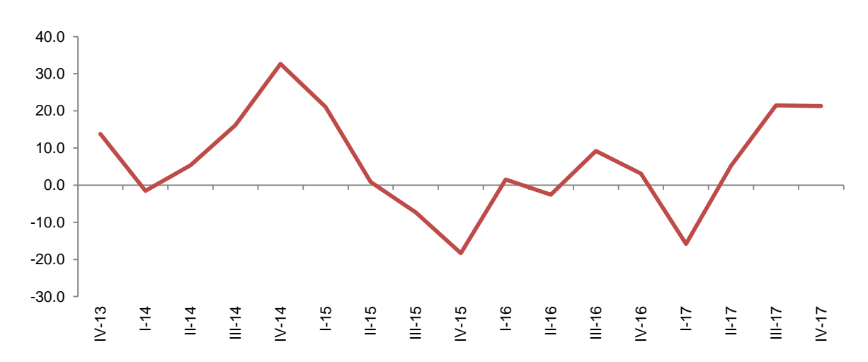
Fig. 2 Annual changes of Turnover volume index, Electricity, Gas, Steam