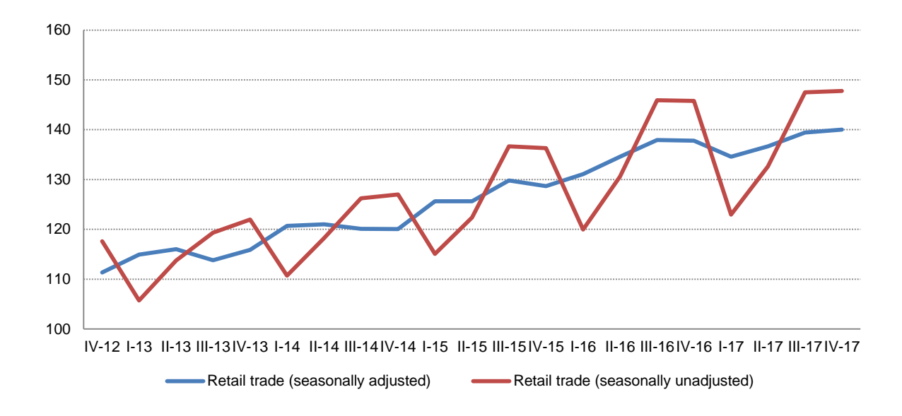
Fig. 1 Volume turnover index on retail trade

Tirana, March 15: In the fourth quarter 2017, the turnover volume index increased 1.3 %, compared with the same quarter 2016. This indicator seasonally adjusted, compared with the previous quarter increased 0.4%.