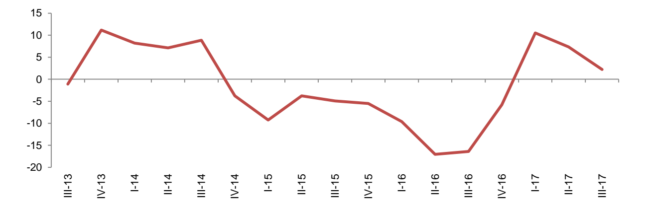
Fig. 1 Annual changes of Turnover volume index, Industry (%)