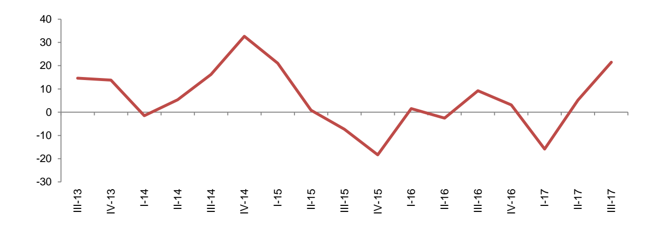
Fig. 2 Annual changes of Turnover volume index, Electricity, gas, steam