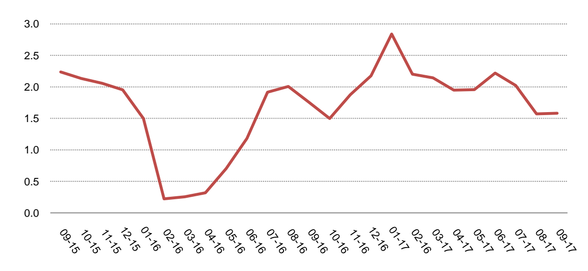
Fig. 1 Annual rate of consumer price index

In September 2017 the annual rate of consumer price is 1.6 %. A year before the annual rate was 1.8 %.