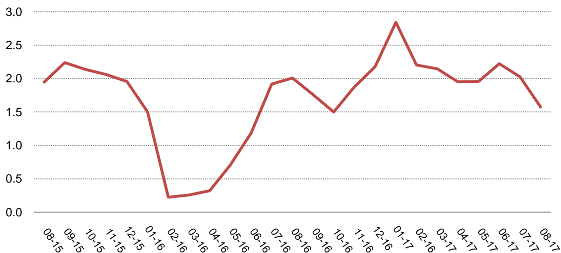
Fig. 1 Annual rate of consumer price index

Contribution of main groups in yearly changes of CPI: Annual growth rate in August was push up mainly from “Food and non-alcoholic beverage” group by +1.26 p.p.. Prices of “Housing, water, electricity and other fuel” group contributed by +0.23 p.p.. Prices of “Different goods and service” group contributed by +0.15 p.p.. Prices of “Alcoholic beverages and tobacco”, “Transport” and “Education service” groups contributed each of them by + 0.03 p.p.. Prices of “Clothing and footwear” and “Furniture household goods and maintenance” contributed respectively by -0.08 p.p. and -0.06 p.p.. Prices of “Recreation and culture” group contributed by -0.03 p.p..