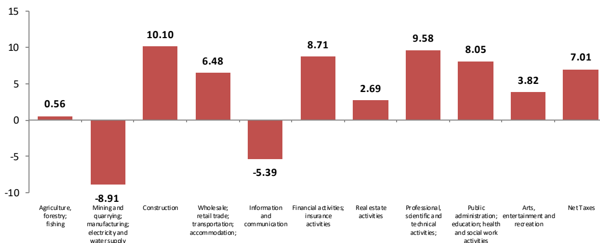
Fig. 2 Changes in % to the same quarter of 2023 for the main branches of the economy, (Q2_2024/Q2_2023)