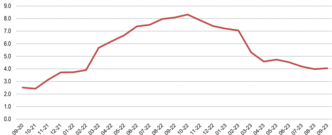
Fig. 1 Annual rate of consumer price index

Contribution of main groups in yearly changes of CPI: Annual growth rate in September was influenced mostly from prices of group “Food and non-alcoholic beverage” by +2.80 p.p., followed by of “Housing, water, electricity and other fuel” group contributed by +0.41 p.p.. “Furniture household goods and maintenance” group by +0.40 p.p.. Prices of “Hotels, coffee-house and restaurants” group contributed by +0.21 p.p.. Prices of “Miscellaneous goods and services” group contributed by +0.17 p.p.. Prices of “Alcoholic beverages and tobacco” by +0.15 p.p.. Prices of “Recreation and culture” group contributed by +0.12 p.p.. “Clothing and footwear” groups contributed by +0.11 p.p.. Prices of “Education service”, “group by +0.07 p.p.. Health” group contributed by +0.06 p.p.. Price of “Communication” group contributed by +0.03 p.p.. Price of “Transport” group contributed by -0.46 p.p..