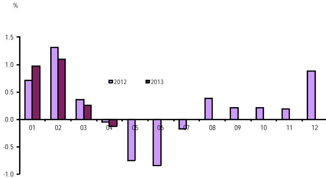
Yearly changes of Consumer Price Index, 2012-2013