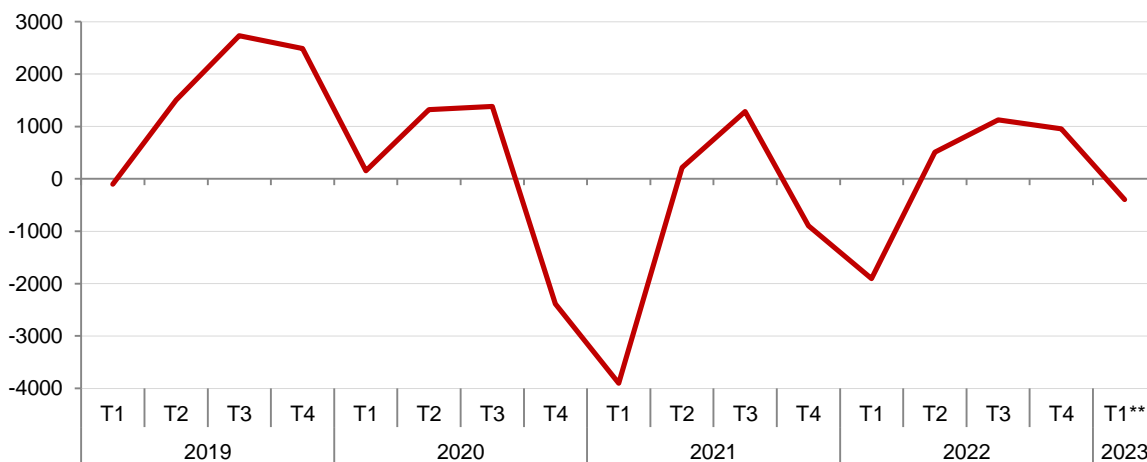
Fig. 1 Natural population increase

The prefecture with the highest natural population increase was Tiranë, with 3,262 births more than deaths, while the prefecture with the lowest natural population increase was Korçë, with 959 deaths more than births.