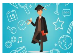
Population with tertiary education