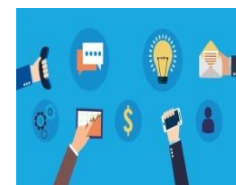
Sales of innovative products