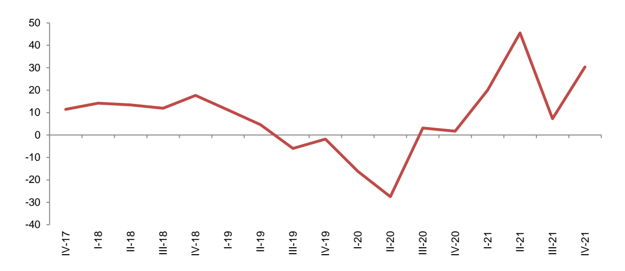
Fig. 3 Annual changes in Turnover volume index, Water supply; Sewerage, Waste management and Remediation activities (%)