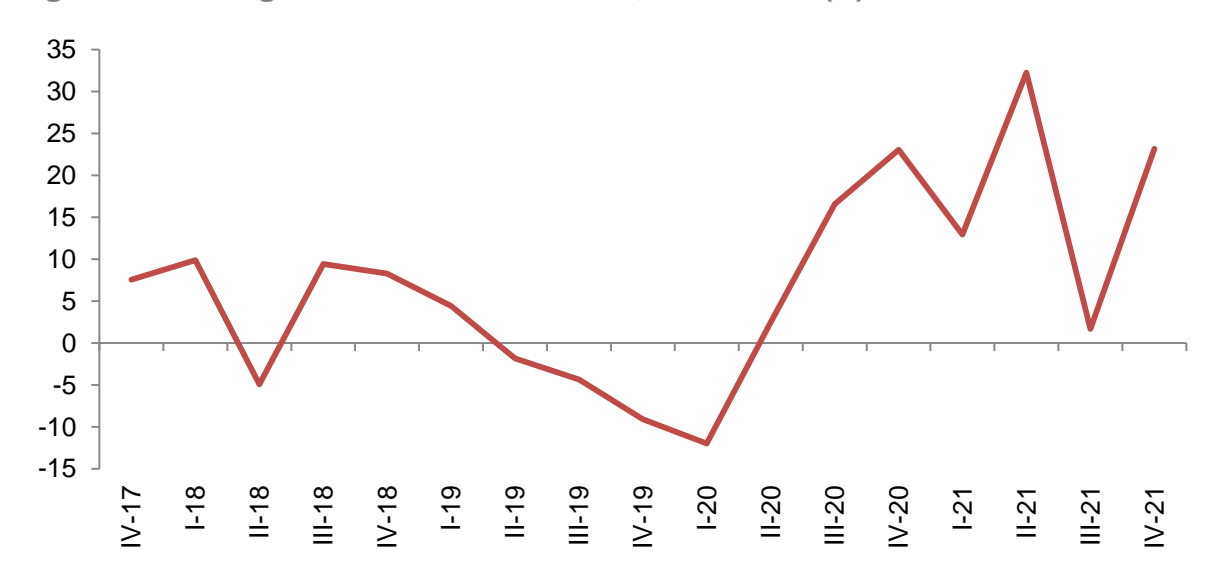
Fig. 4 Annual changes in Turnover volume index, Construction (%)