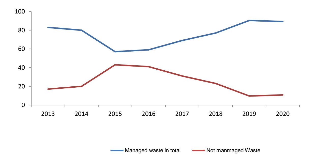
Fig. 3 Urban waste management rate in (%)