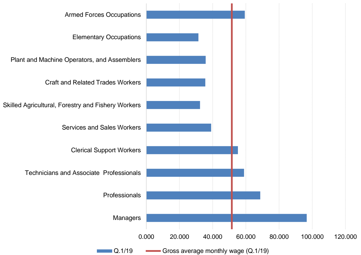
Tab. 1 Average gross monthly wage per employee and approved minimum wage