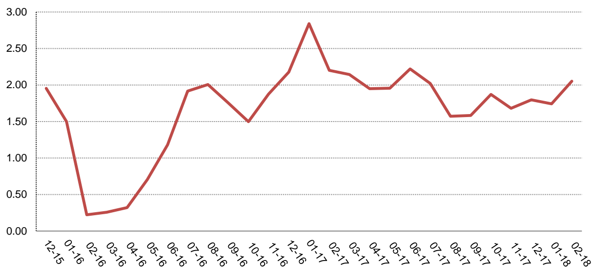
Fig. 1 Annual rate of consumer price index

Contribution of main groups in yearly changes of CPI: Annual growth rate in February was push up mainly from "Food and non-alcoholic beverage" group by +1.03 p.p. Prices of "Housing, water, electricity and other fuel" group contributed by +0.62 p.p. Prices of "Transport" group contributed by +0.14 p.p. Prices of "Clothing and footwear" group contributed by +0.11 p.p. Prices of "Alcoholic beverages and tobacco" group contributed by +0.06 p.p. Prices of "Communication" group contributed by +0.03 p.p. Prices of "Education service", "Hotels, coffee-house and restaurants" and "Different goods and service" groups have contributed by +0.02 p.p. each of them. Prices of "Housing, water, electricity, gas and other fuels" group contributed by +0.01 p.p.